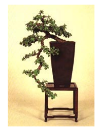
Figure 7. Elephant bush ( Portulacaria afra ), trained in the cascade style, has a characteristic leader, which descends below the bottom edge of the container. A cascaded bonsai usually looks best in a round or hexagonal container.

Training a tree in the cascade style takes longer than in the slanting style. Choose a low-growing species instead of forcing a tree that normally grows upright into an unnatu-