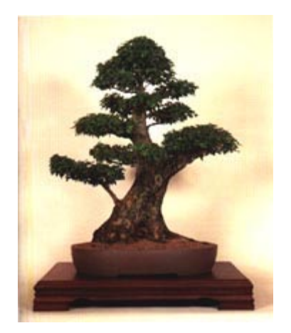
Figure 3. This trident maple ( Acer buergerianum ) bonsai, is trained in the informal upright style. The style is similar in branch placement to the formal upright style, but differs because of the angularity of the trunk.