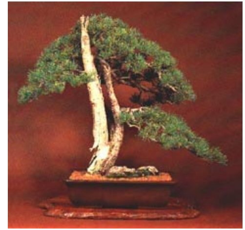
Figure 13. In addition to deadwood, the trunk of this bonsai plant ( Pinus flexilis ) has cracks and scaly ridges that give it a look of age. Note the off-center placement of the tree in the container.

Bonsai plants must be anchored to their containers until the roots take hold. One method used to anchor the plant is to tie it down with wires leading up through the screens that are placed over the drainage holes in the container. After tying the plant to the container, adjust the plant's elevation.