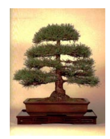
Figure 2. The formal upright style features a straight trunk, and a bottom branch that is lower and extends further from the trunk than its opposite. This specimen is a Mugho pine ( Pinus mugo 'Mugo').

The informal upright style looks best in an oval or rectangular container. It should be planted, not in the center of the container, but a third of the distance form one end.