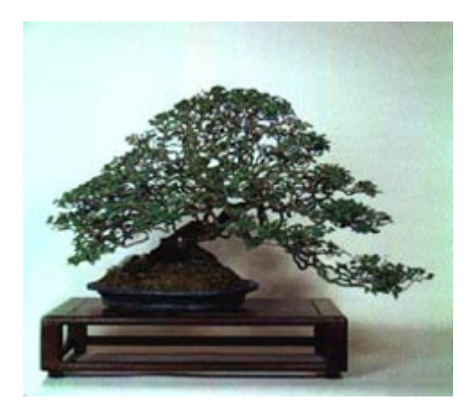
Figure 6. In the slanting style the trunk has a more acute angle than in the informal upright style. This specimen is a Lantana , salvaged from a construction sight in 1959.