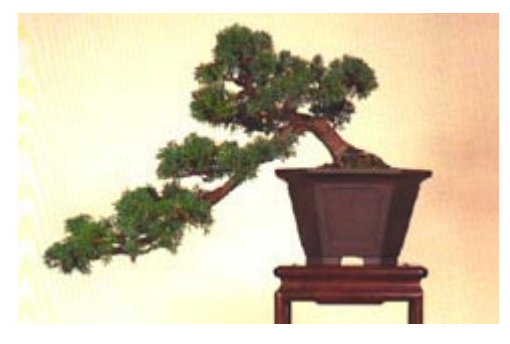
Figure 9. This Shimpaku juniper ( Juniperus chinensis 'Sargentii' 'Shimpaku' ) in a hexagonal container was trained in the semi-cascade style. Prostrate junipers and flowering plants are well adapted to cascade and semi-cascade styles.