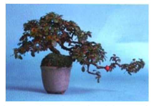
Figure 10. The semi-cascade style has a curving trunk that does not reach the bottom of the container as it does in the cascade style. This example is a little leaf Cotoneaster ( Cotoneaster microphylla ).