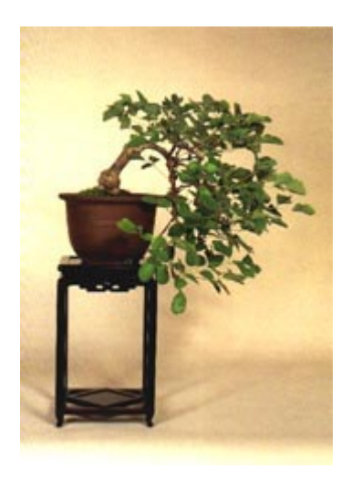
Figure 8. The cascade style of bonsai represents a natural tree growing down the face of an embankment. This specimen is a three leaf Akebia ( Akebia trifoliate ) estimated to be about 30 years old.

ral form. Bend the whole tree forward so one back branch is vertical and the side branches fall naturally.