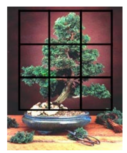
Figure 12. The "rule of thirds" is a useful design aid when planning the overall form of your bonsai. The total space of plant and container is divided into thirds, both horizontally and vertically.

Three basic operations are necessary to establish the basic form in bonsai culture: pruning, nipping, and wiring.