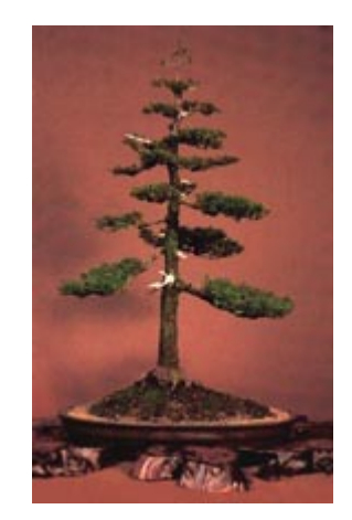
Figure 1. Note the off-center placement of this redwood ( Sequoia sempervirens ) in its oval container. This tree was trained in the formal upright style, which is considered the easiest for the novice bonsai grower.

The informal upright style has much the same branch arrangement as the formal upright style, but the top — instead of being erect as in the formal upright style — bends slightly to the front. This bend makes the tree's branches appear to be in motion and enhances the look of informality (Figures 3 and 4).