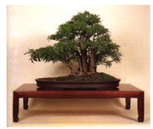
Figure 11. A group planting in any of the bonsai styles makes use of only one species of tree. A Banyan ( Ficus neriifolia 'Regularis') is shown here.

Some old favorites grown as bonsai because of their classical good looks are Sargent juniper ( Juniperus chinensis Sargentii); Japanese black pine ( Pinus thunbergii ); wisteria ( Wisteria floribunda , Wisteria sinensis ); flowering cherries ( Prunus subhirtella , Prunus yedoensis ); and gray bark elm ( Zelkova serrata ).