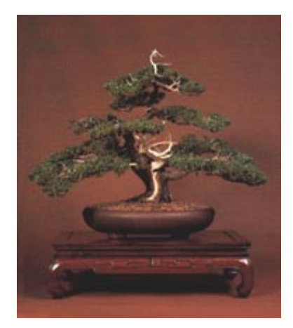
Figure 4. The trunk in the informal upright style bends slightly to the front. This specimen is 32 years old, a San Jose juniper ( Juniperus san jose ) in training since it was a seedling.