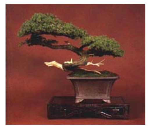
Figure 5. This common juniper ( Juniperus com munis ), estimated to be about 80 years old, was collected in 1979, and has been trained in the slanting style of bonsai. In this style, the lowest branch spreads in the opposite direction to the slant of the tree.

Slanting trees in nature are called "leaners" — trees that have been forced by the wind and gravity into nonvertical growth. The attitude of the slanting style falls between the upright and cascade styles. This style looks best planted in the center of a round or square container.